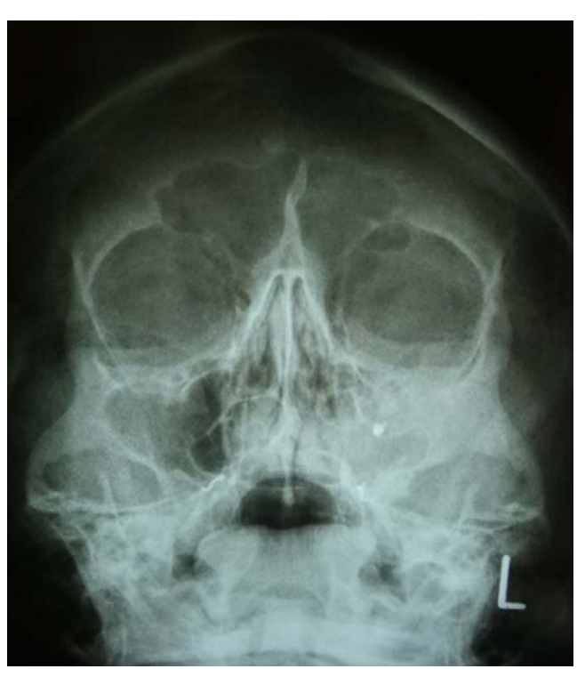
Figure 3. X-ray of the sinuses in 58-year-old female – visible shadow of a foreign body in the cavity of the left maxillary sinus with obstructed aeration.

A foreign body provokes an inflammatory reaction and impairs mucociliary flow which results in sinuses ventilation disturbances, which provide favourable conditions for fungal growth [13].