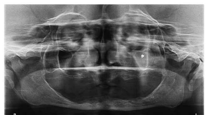
Figure 2. Panoramic radiograph with visible endodontic material in the cavity of the left maxillary sinus