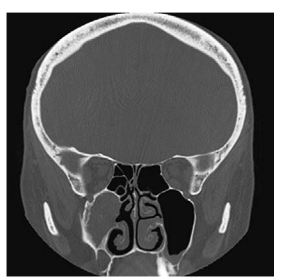
Figure 1. Computed tomography of maxillary sinuses of a 59-year-old female – complete darkening of the right maxillary sinus with calcium concrements

X-rays reveal typical features of chronic sinusitis – partial or complete darkening of the cavity of the sinus [1, 5, 6, 10]. Pathognomonic picture of the fungal sinusitis is homogeneous darkening of the cavity of the sinus, with a semilunar air space between aspergilloma and the upper wall of the sinus [3]. Computed tomography, due to its higher sensitivity, often shows foreign bodies (such as endodontic material pushed into the cavity of the sinus, or tricalcium phosphorate) in the cavity of the sinus which gather in the aspergilloma.